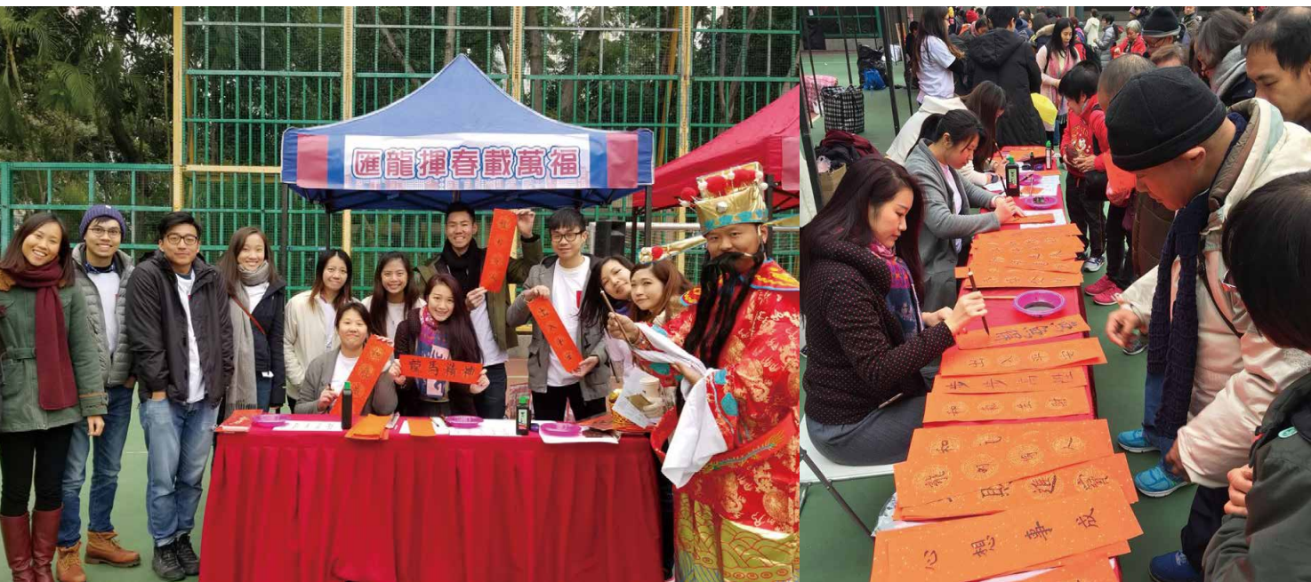
Alumni also supported the HKFYG Neighbourhood First Reunion Lunch in the Eastern District on 3 February 2018 to celebrate Lunar New Year with about 800 residents.