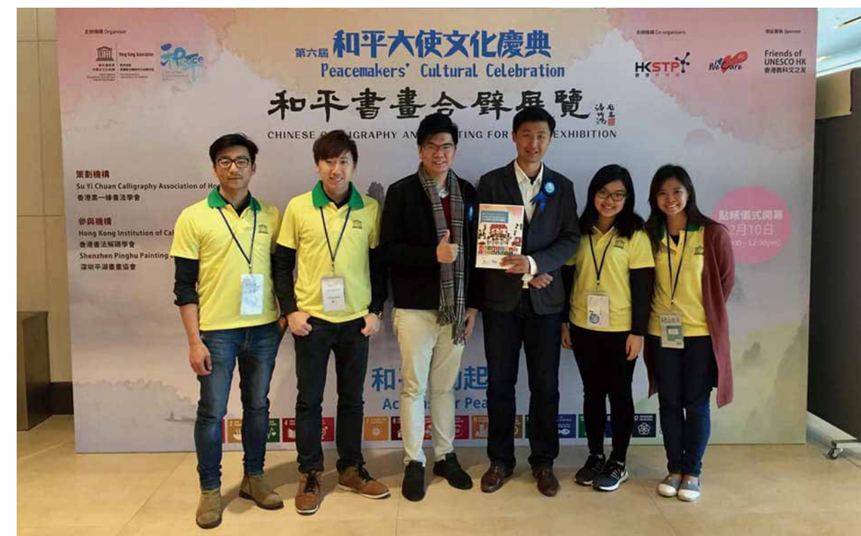
Apart from social gatherings, Dragons also demonstrated the sense of social responsibility by volunteering in the community. Several of them volunteered in the Peacemaker's Cultural Celebration organized by the UNESCO.