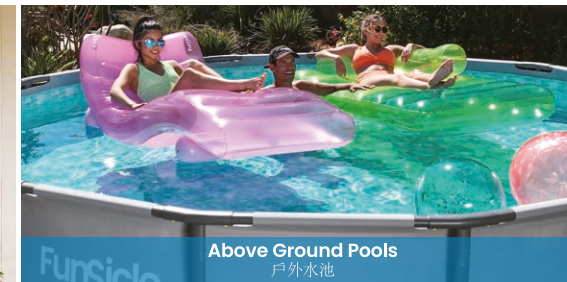
Above Ground Pools 戶外水池