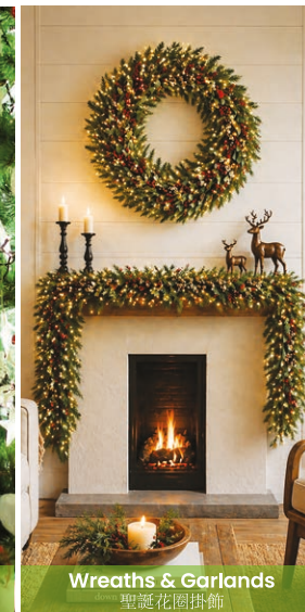
Wreaths & Garlands 聖誕花園掛飾