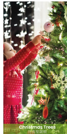
Christmas Trees 仿真聖誕樹

憑藉超過 30 年經驗，我們設計、製造並於全球銷售季節性家居裝飾與戶外休閒產品——啟發人們更投入玩樂和享受節日慶祝。